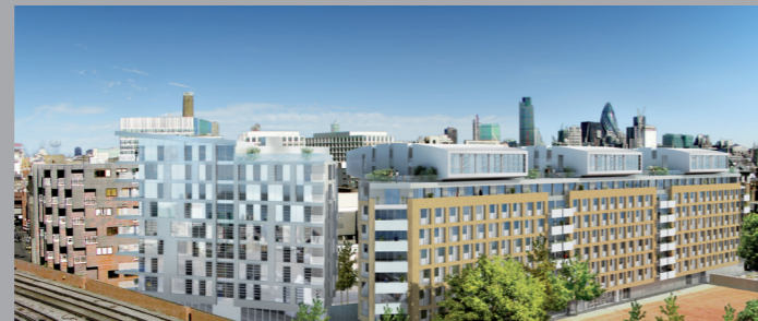
MOONRAKER POINT 654 rooms