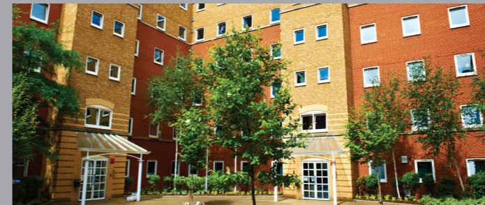
GREAT DOVER STREET 769 rooms