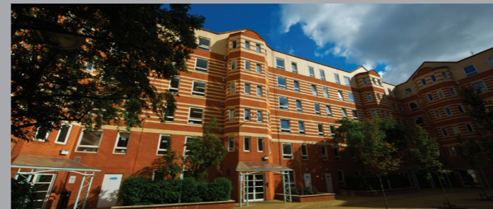
STAMFORD STREET 550 rooms