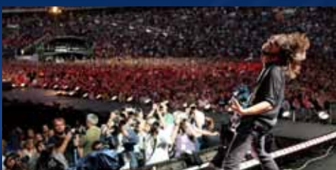
Stats correct at end of May 2012